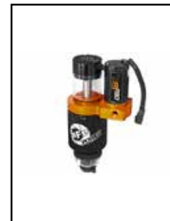
Diesel Fuel System

P/N: 42-14011 (Full-time) 42-14012 (Part-time)