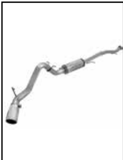
DP-Back Exhaust System

P/N: 49-44073-B (Blk Tip) 49-44073-P (Pol Tip)