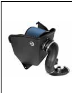
Cold Air Intake System