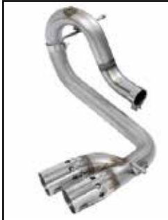
Side-Exit Exhaust System

P/N: 49-44065-B (Blk Tip) 49-44065-P (Pol Tip)