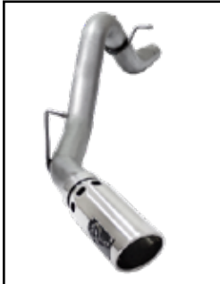
DPF-Back Exhaust System

P/N: 49-44064-B (Blk Tip) 49-44064-P (Pol Tip)