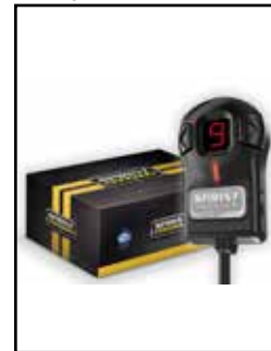
Sprint Booster V3

P/N: 46-70302 (Black) 46-70302-WL (w/ Oil) Turbo Downpipe