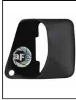
Dynamic Air Scoop

P/N: 54-12218 (Black) 54-12218-C (C/F) 54-12218-R (Red) 54-12218-L (Blue)