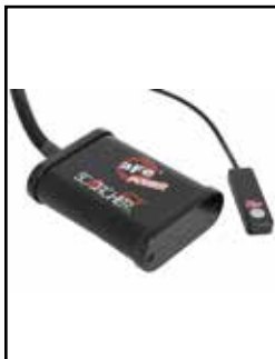
P/N: 77-46322 (Sensor 1)