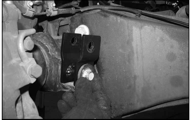
FIGURE 8 - STEP 7