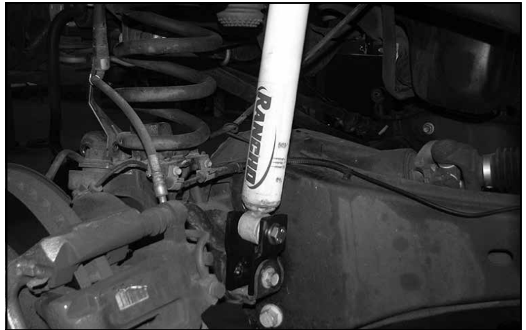
FIGURE 9 - STEP 8