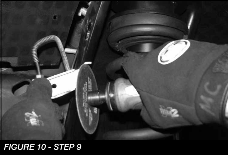
FIGURE 10 - STEP 9