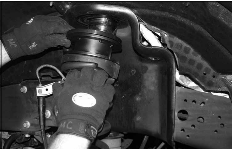
FIGURE 7 - STEP 6